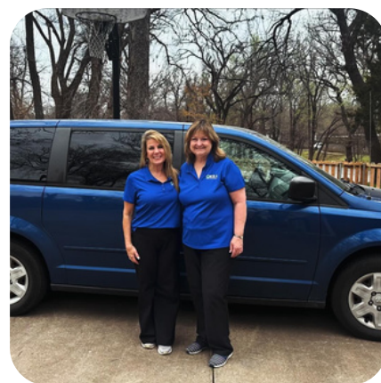
State Capitol -Day of Advocacy

Board Meeting Dates July 19 September 20 December 6