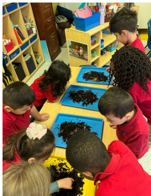
Earth Day worm composting at Dove Science Academy Elementary