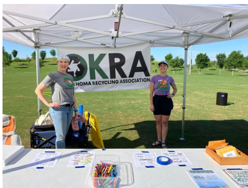
2nd Annual Compost Festival, Scissortail Park