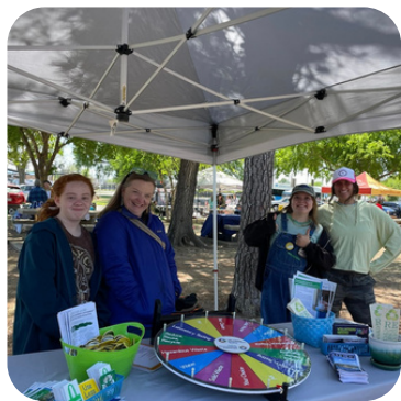
Midwest City Earth Day Event