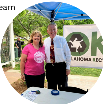
Environmental Expo at Guthrie Green, Tulsa