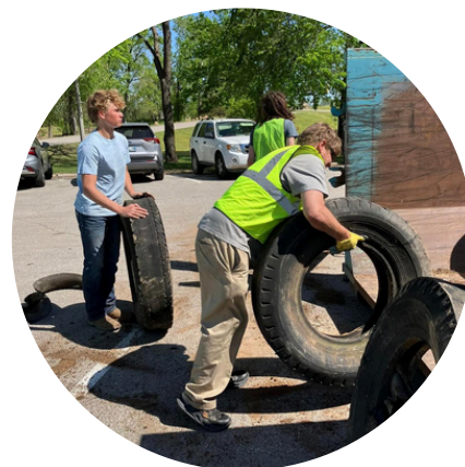
M.e.t take back event