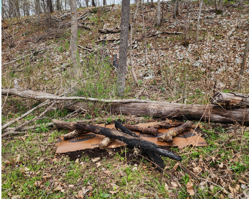
TRAVIS HINSHAW- RECYCLE