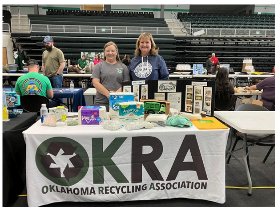
Cherokee Nation Environmental Fair