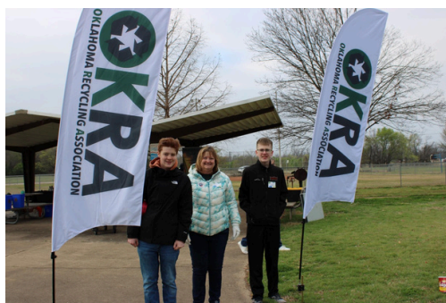
Oklahoma Recycling Festival, Stillwater