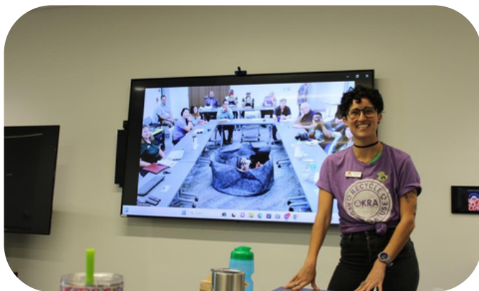
International Compost Awareness Week Lunch & Learn