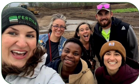
Okie Recycling Tour- City of Norman Compost Facility