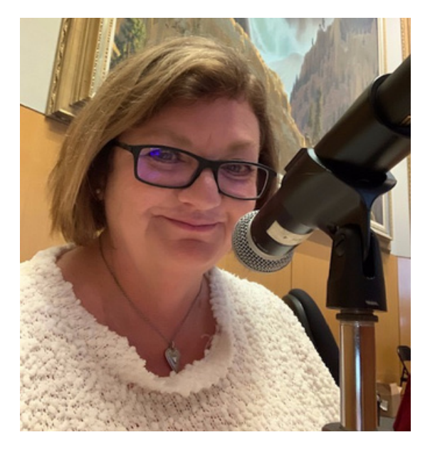
Greetings from the President of OKRA 2023!

I am also the executive director of Keep McAlester Beautiful. That's me in the center of the picture, hat, dark glasses, with some of our volunteers after a recent successful brush clean in McAlester. Keep McAlester Beautiful doesn't run the recycling center in McAlester, but we do promote it. KMB is the reason McAlester has recycling at all.