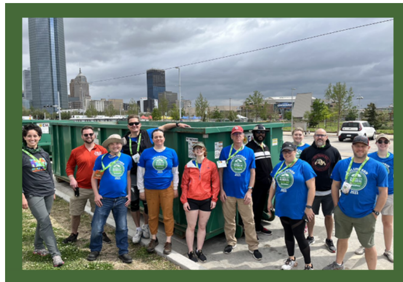
OKCMM Green Team