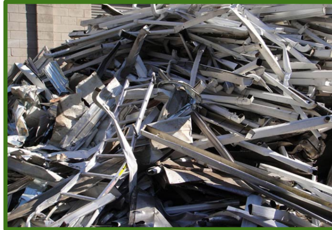
16,500 lbs. scrap metal