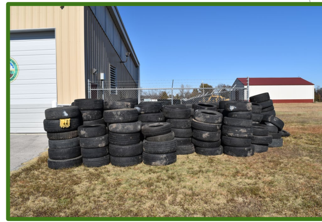
15,020 lbs. tires

= 470,820 lbs. of waste kept out of our waterways and off of our lands!