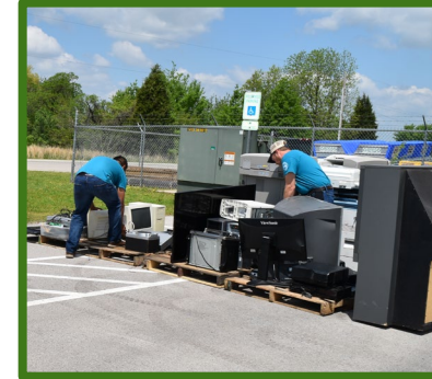
19,170 lbs. e-waste

= 249,931 lbs. of waste kept out of the landfill!