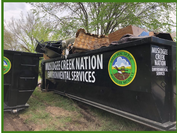
439,300 lbs. solid waste