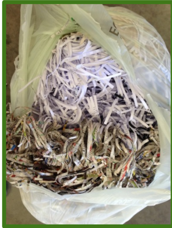
38,204 lbs. shredded paper