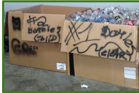
8,278 lbs. plastics #1 & #2