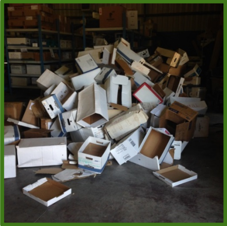
183,831 lbs. cardboard