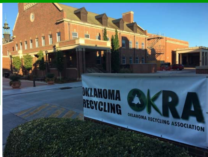
The OSU Stillwater campus is a welcoming setting in a central location