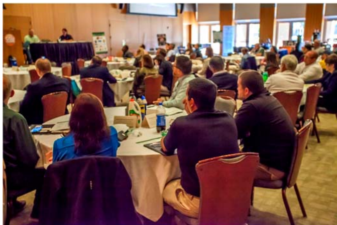
Participants listen to a panel at the 2017 conference

with Greenshortz Media, produces short videos about easy ways to recycle and will share ways to create and customize those for a targeted audience.