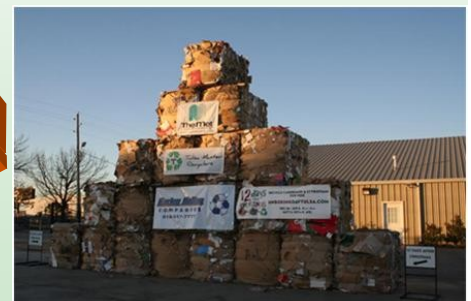
Bales of Cardboard