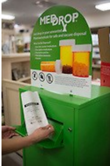
Collection Box at Razook's Drug

“All too often, people simply dispose of over-the-counter and prescription medications by throwing them in the trash or flushing them down the toilet,” Malley said. “Both methods allow medications to be released into the environment and contaminate our drinking wa-