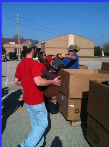
NWOSU Students volunteering at Alva's Big Event collected many pallet loads of old electronic equipment. (see pg 2)