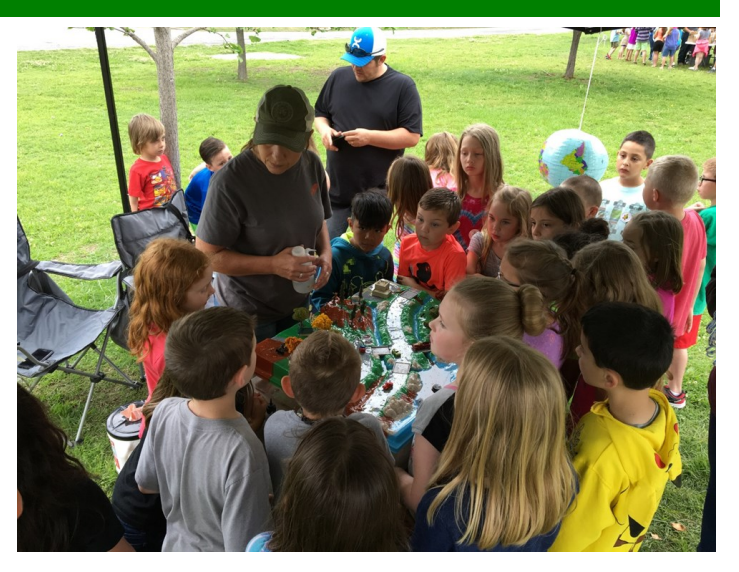
Increasing Environmental Stewardship through education and outreach

The Environmental staff talked about the impact of litter, motor oil and other items that are often dumped into our area waterways. The Forestry staff presented the story of Smokey the Bear and talked about forest fires. The Ag Outreach staff talked about pollinators, types of soil, facts about fish and seed germination.