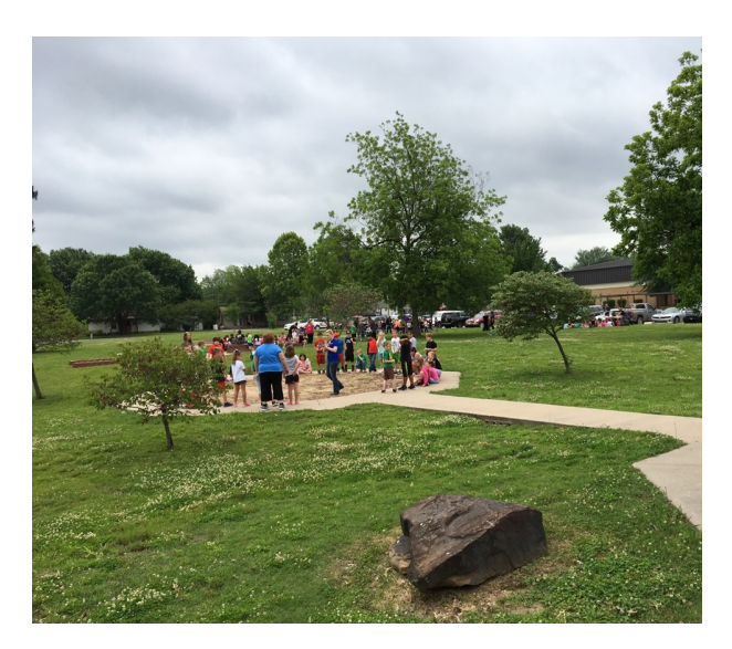
Students learn the impacts that their actions can have on the environment